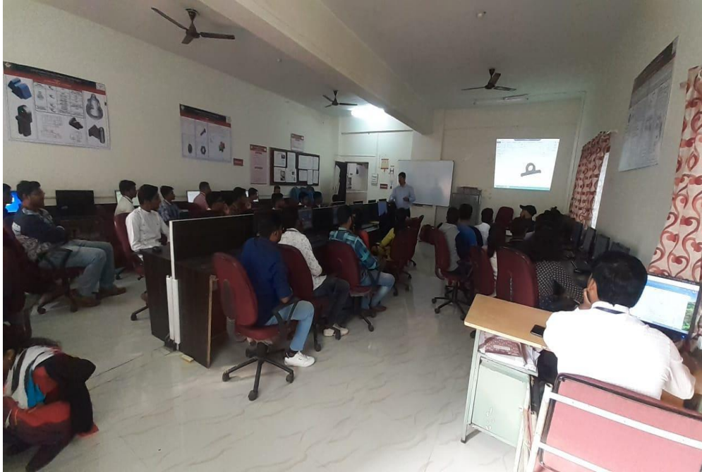
Training session conducted by trainer.