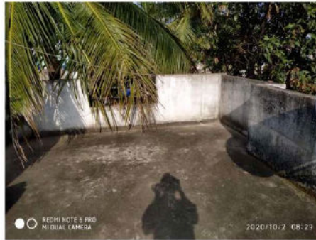
Prajakta navtakte SE(ENTC)