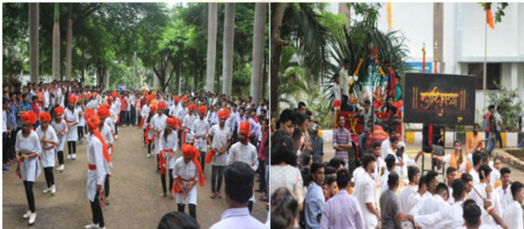
Students performing Lezim