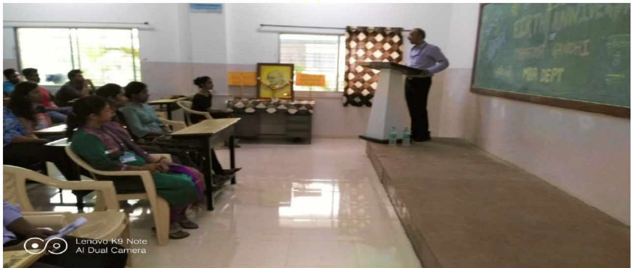
Vice Principals Talk on Gandhi Jayanti Celebration